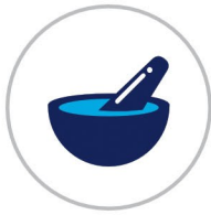
Herbal and Phytoextracts