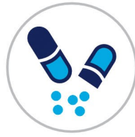
Pellets and Granules