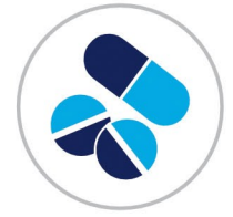
Finished Dosage Forms