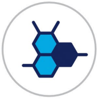
Active Pharmaceutical Ingredients (APIs)