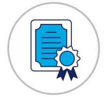
Regulatory Service for Europe Business